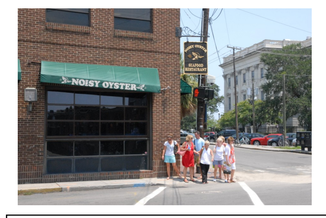
This is how our family crosses the street!!

FOLSOM EDITOR - JUSTIN PIKE FOLSOM PHOTOGRAPHER - PATRICK PIKE