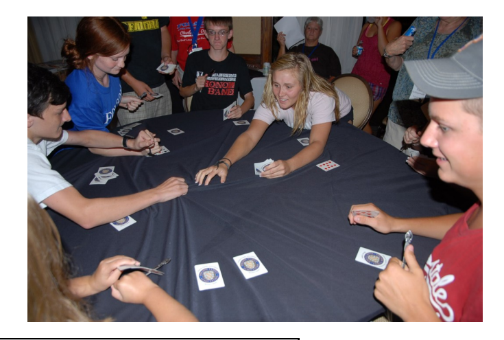
The Spoons Competition at the reunion was a difficult and DANGEROUS game, at least no one got hurt.